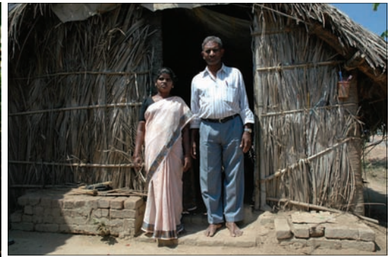
Outside and inside the pastor's house.